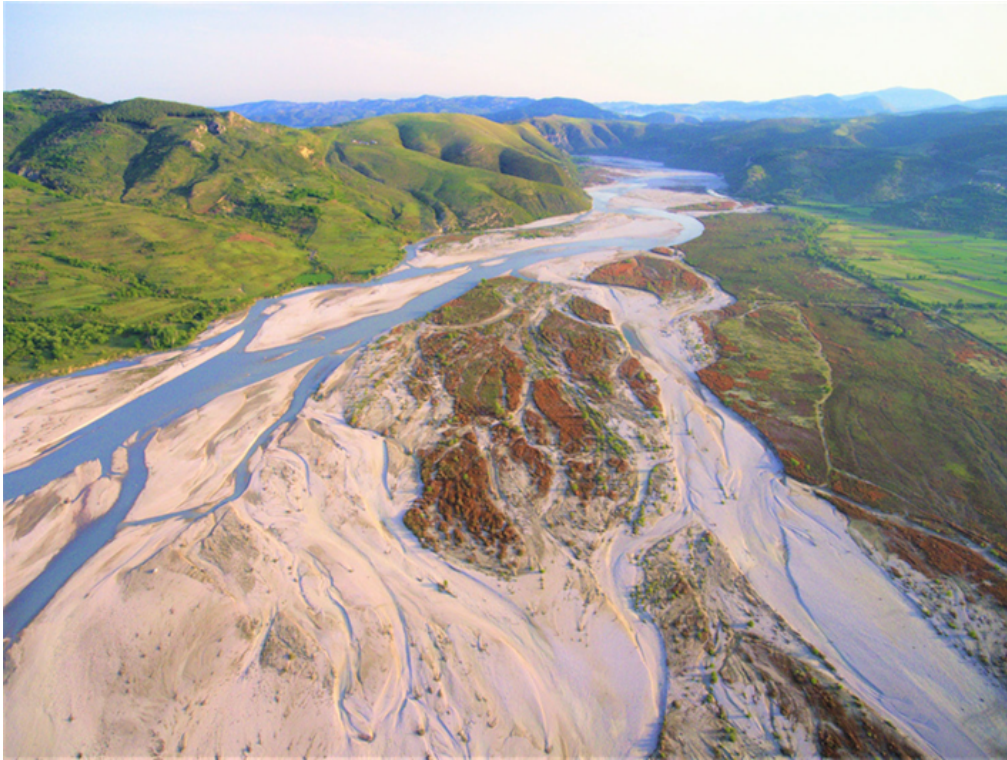
Vjosa Web

On 15 March 2023, Albania's Prime Minister Edi Rama and Minister of Environment and Tourism Mirela Kumbaro declared the Vjosa River a Wild Rivers National Park at a formal ceremony in Tepelena. The entire Vjosa River and its main tributaries - in total a river system of more than 400 km in length - have been designated as a national park in Albania. This is unique in Europe.